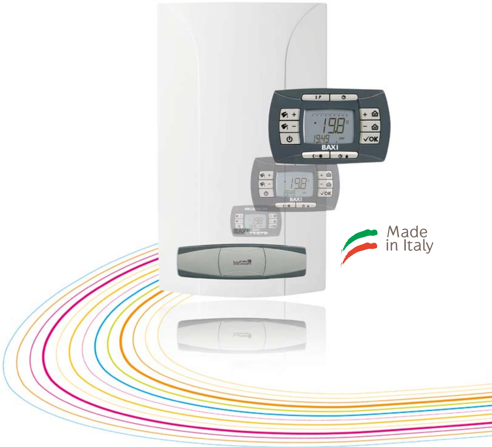
Gas wall hung boilers